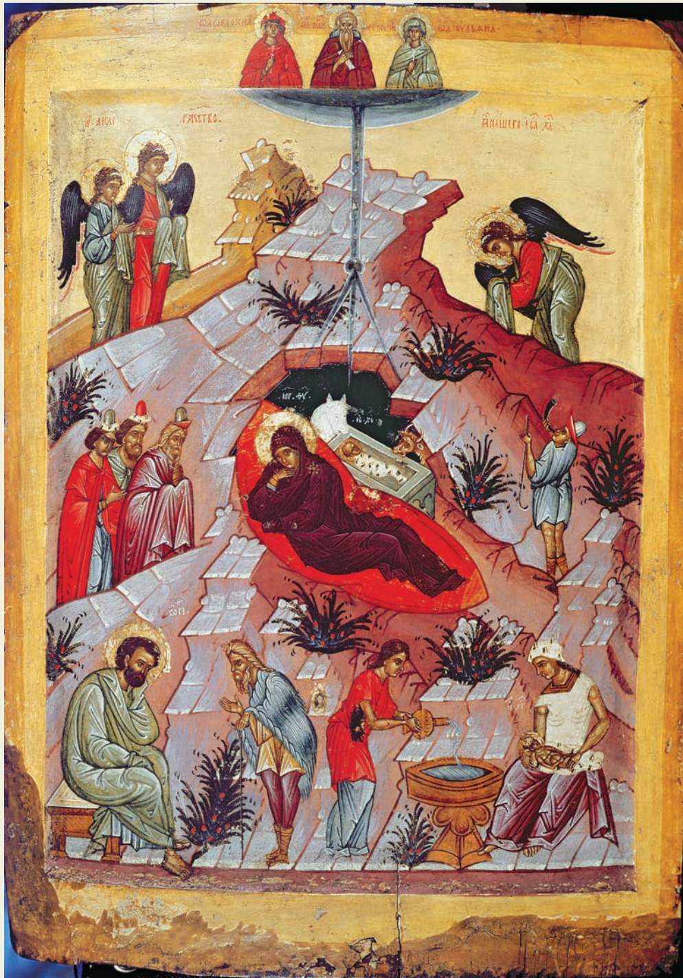
Visual Source 10.2 The Nativity (Private Collection/The Bridgeman Art Library)