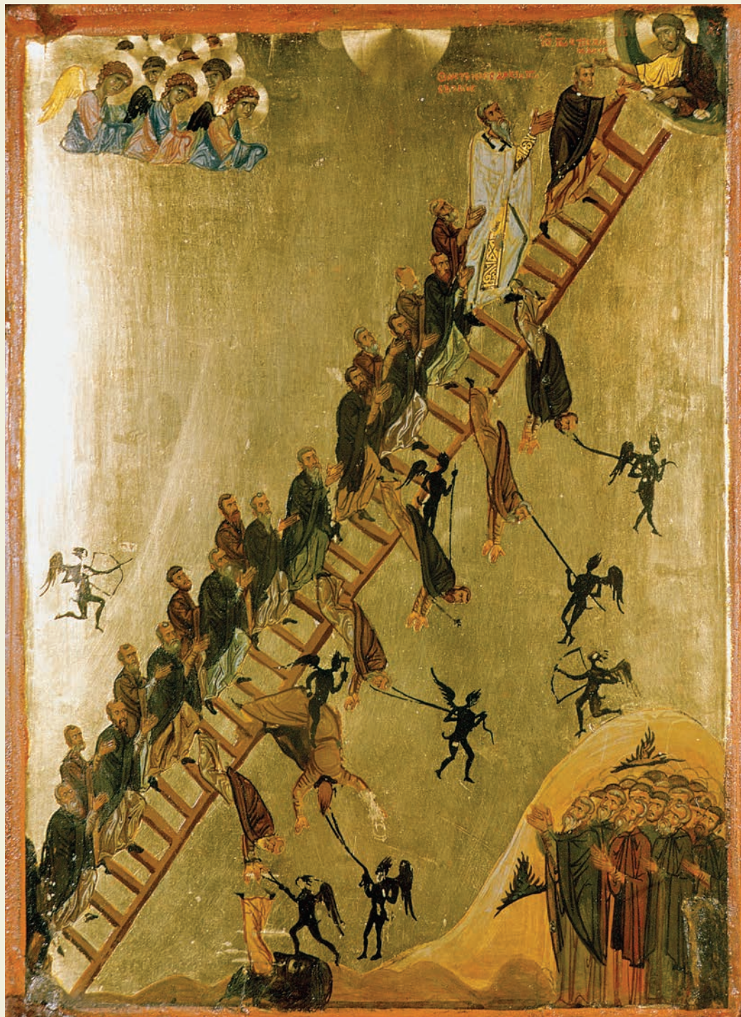
Visual Source 10.3 Ladder of Divine Ascent