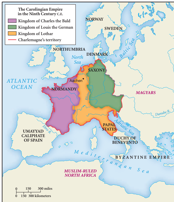
Map 10.2 Western Europe in the Ninth Century Charlemagne's Carolingian Empire brought a temporary unity to parts of Western Europe, but it was subsequently divided among his three sons, who waged war on one another.

unsuccessful in reviving anything approaching Roman imperial authority, these efforts testify to the continuing appeal of the classical world, even as a new political system of rival kingdoms blended Roman and Germanic elements.