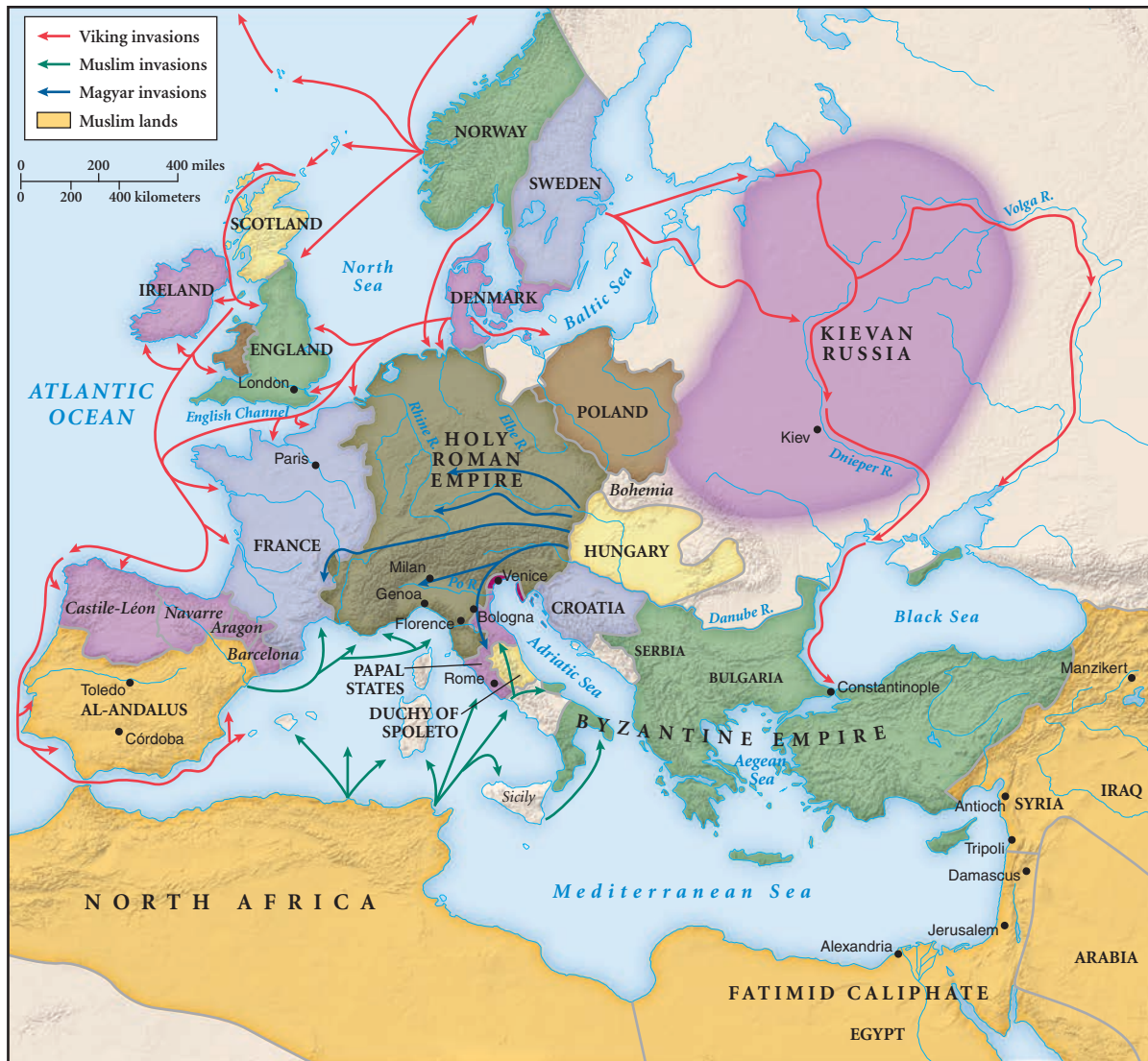
Map 10.3 Europe in the High Middle Ages

By the eleventh century, the national monarchies—of France, Spain, England, Poland, and Germany—that would organize European political life had begun to take shape. The earlier external attacks on Europe from Vikings, Magyars, and Muslims had largely ceased, although it was clear that European civilization was developing in the shadow of the Islamic world.