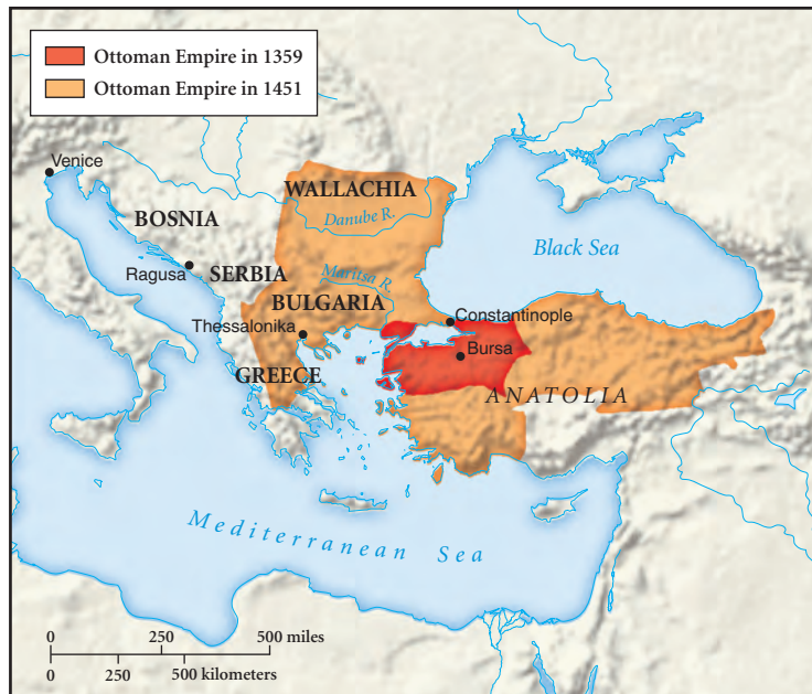
Map 11.3 The Ottoman Empire by the Mid-Fifteenth Century

As Turkic-speaking migrants bearing the religion of Islam penetrated Anatolia, the Ottoman Empire took shape, reaching into southeastern Europe and finally displacing the Christian Byzantine Empire. Subsequently, it came to control much of the Middle East and North Africa as well.