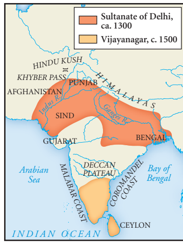
The Sultanate of Delhi

between Islam and a Hindu-based Indian civilization. Beginning around 1000, those conquests gave rise to a series of Turkic and Muslim regimes that governed much of India until the British takeover in the eighteenth and nineteenth centuries. The early centuries of this encounter were violent indeed, as the invaders smashed Hindu and Buddhist temples and carried off vast quantities of Indian treasure. With the establishment of the Sultanate of Delhi in 1206, Turkic rule became more systematic, although their small numbers and internal conflicts allowed only a very modest penetration of Indian society.