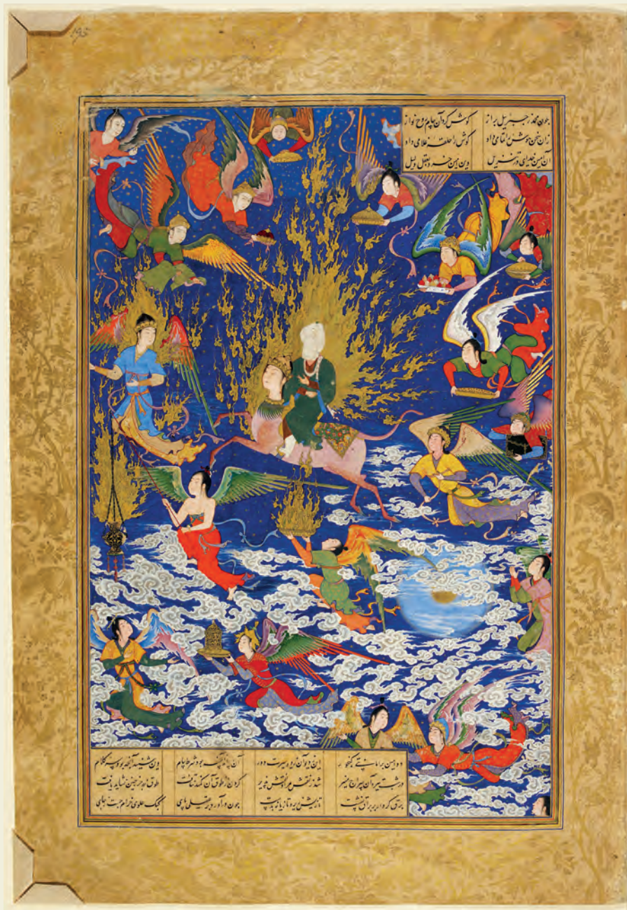
Visual Source 11.3 The Night Journey of Muhammad