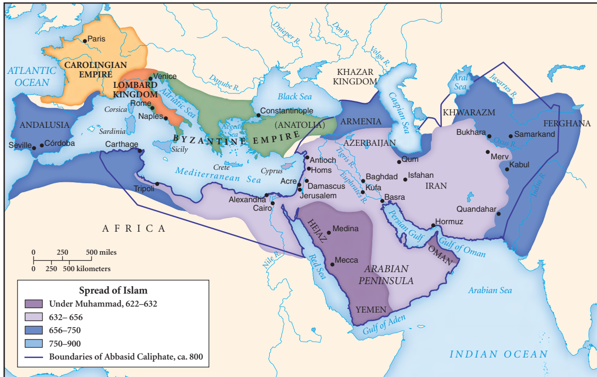
Map 11.1 The Arab Empire and the Initial Expansion of Islam, 622–900 c.E.

Far more so than with Buddhism or Christianity, the initial spread of Islam was both rapid and extensive. And unlike the other two world religions, Islam gave rise to a huge empire, ruled by Muslim Arabs, which encompassed many of the older civilizations of the region.