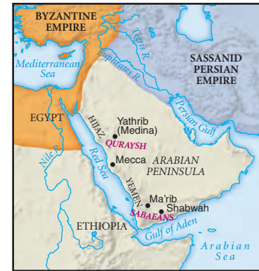
Arabia at the Time of Muhammad

The catalyst for those events and for the birth of this new religion was a single individual, Muhammad Ibn Abdullah (570–632 C.E.), who was born in Mecca to a Quraysh family. As a young boy, Muhammad lost his parents, came under the care of an uncle, and worked as a shepherd to pay his keep. Later he became a trader and traveled as far north as Syria. At the age of twenty-five, he married a wealthy widow, Khadija, herself a prosperous merchant, with whom he fathered six children. A highly